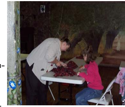
Mother and daughter working together to make a blanket.

Partners for Prosperity recently formed a unique partnership to donate blankets to residents in the region who might need an extra blanket to keep warm this winter. On November 15, members of the Idaho Community Action Network (ICAN) in Pocatello met with P4P staff at the Booth Barn to make fleece blankets. For every blanket members made to donate, they made one for themselves. Some mem-